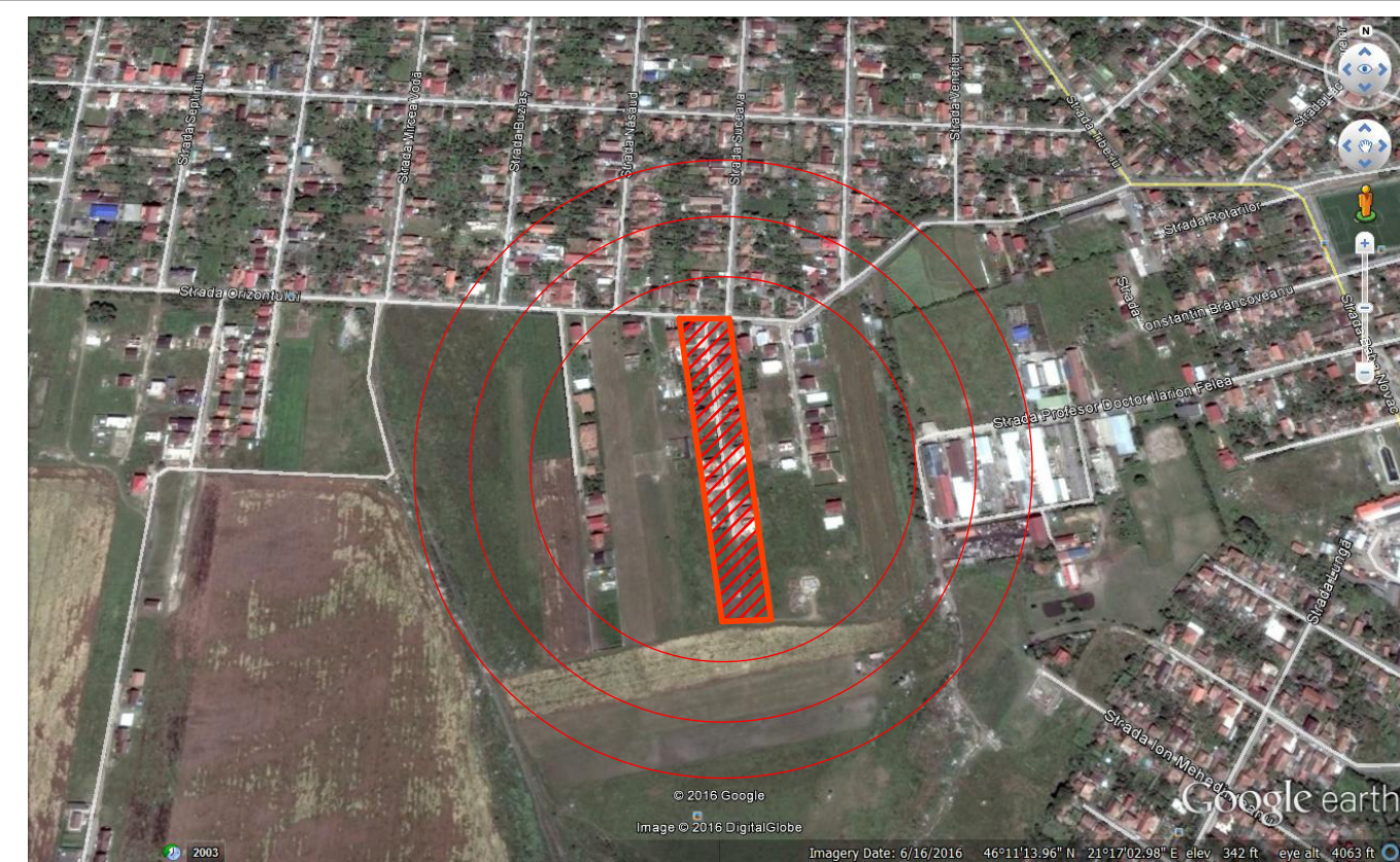
PLAN INCADRARE ZONA Scara 1:10000

PUD aprobat HCL 301/2007 Beneficiar: GABOR PETRU